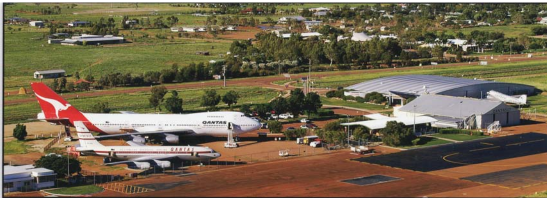
Qantas Founders Museum