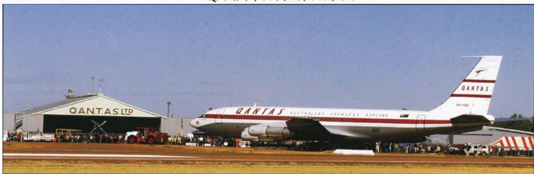
Boeing 707 - Qantas Founders Museum Longreach, Queensland

To see the photos in colour go to website - http://qrsc.org.au/